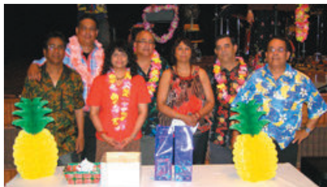
Photo of some of the brightly attired committee members at the Hawaiian Nite - the faces behind the scene.

NEW YEAR'S EVE - HAWAIIAN NITE: a very colourful & fun-filled night that was very well attended. The Springvale Town Hall was decorated to the theme. Excellent prizes, good music, a packed dance floor, a food stall & the youth dance in the small hall were all part of the new year's celebrations. The heavy rains that followed a warm start to the night did not dampen anyone's spirits. Do look up the photo album on the website to catch a glimpse of the Rangers Hawaiian Nite.